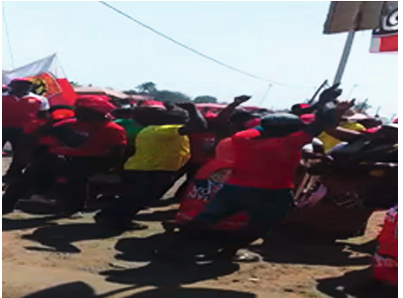
Frelimo electoral violence evidence against the MDM in Chókwè

Gaza Province is the bastion of electoral