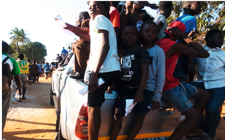
How electoral campaigners have been transported

Electoral campaigners are still being transported in unsafe conditions. However, either public authorities or political parties have been apathic to the situation. More than safe activities, political parties have been only focusing their political goals. The impact of unsafe transportation was observed respectively on September 22, in the district of Chitima in Tete and the district of Balama, Cabo Delgado on September 26. Unsafe transportation of electoral campaigners has caused more than (fifteen) 15 deceases and hundreds of injured people as it has been already reported in the CDD-E bulletin.