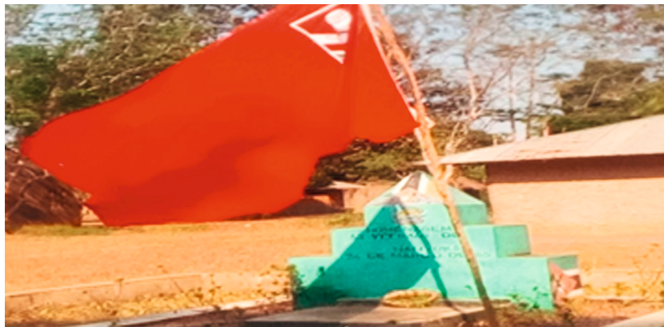
Electoral propaganda of Frelimo in public monuments, district of Muidumbe

On September 25, Frelimo took advantage of the public holiday event as an occasion for electoral campaign in public monuments either in person or through electoral pamphlets or flags.